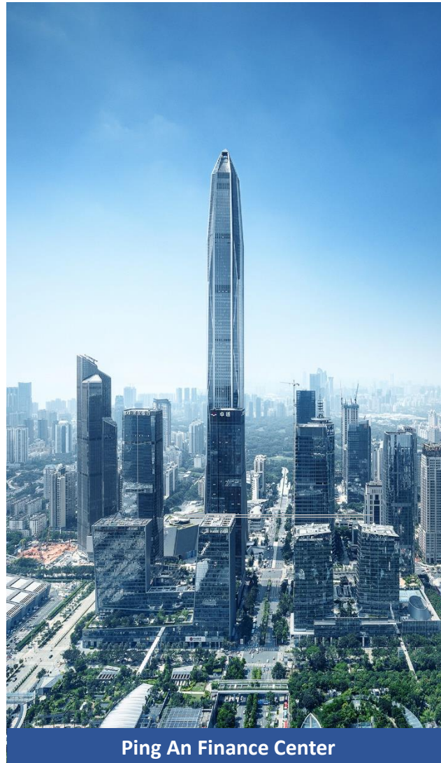
Ping An Finance Center

Tech-hub: home to tech giants such as Tencent, Huawei, DJI and BYD